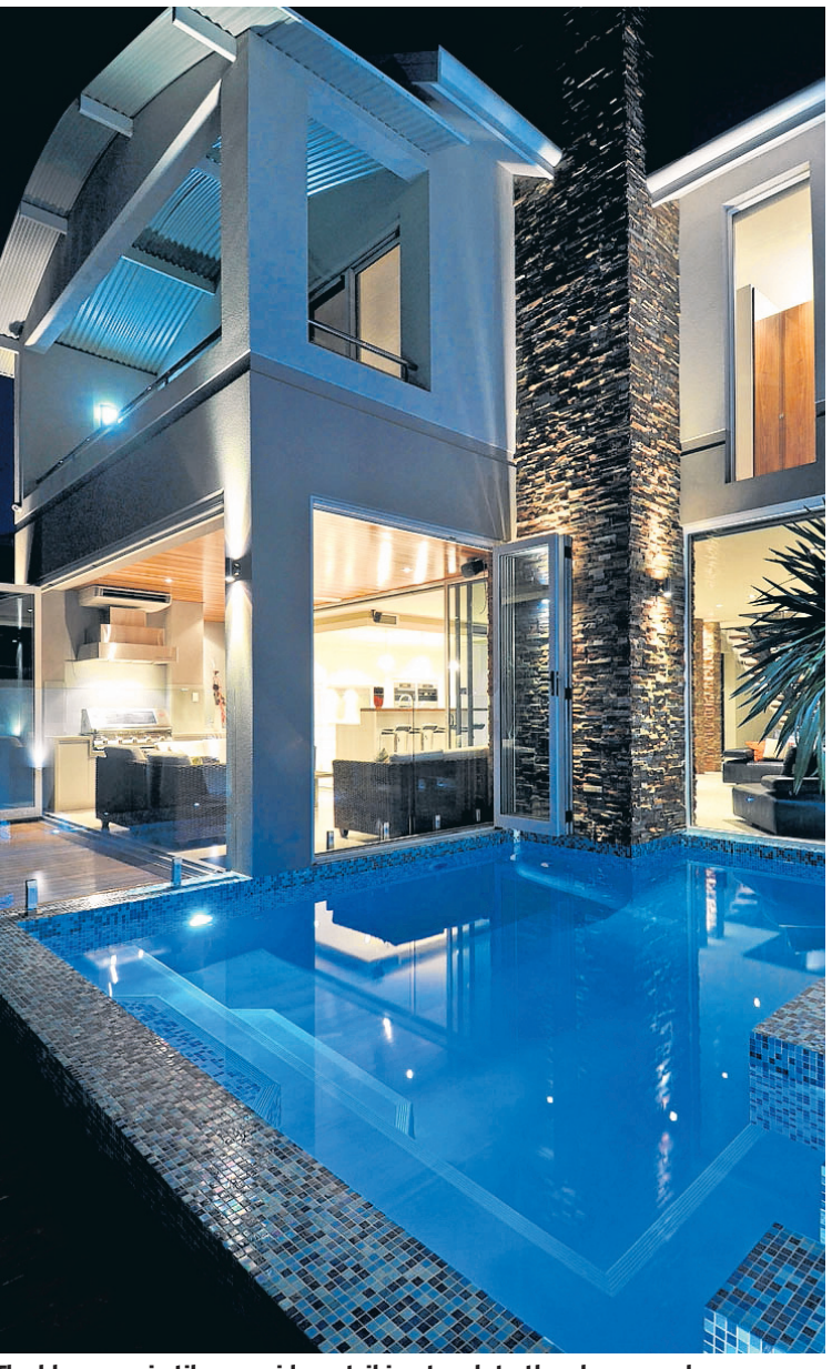
The blue mosaic tiles provide a striking touch to the plunge pool.

Contact details: A1 Pools, 9344 7448; Sol Construction, 0421 314 440.